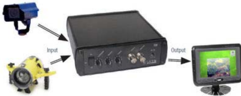
LYYN T38™ - easy to use and connect