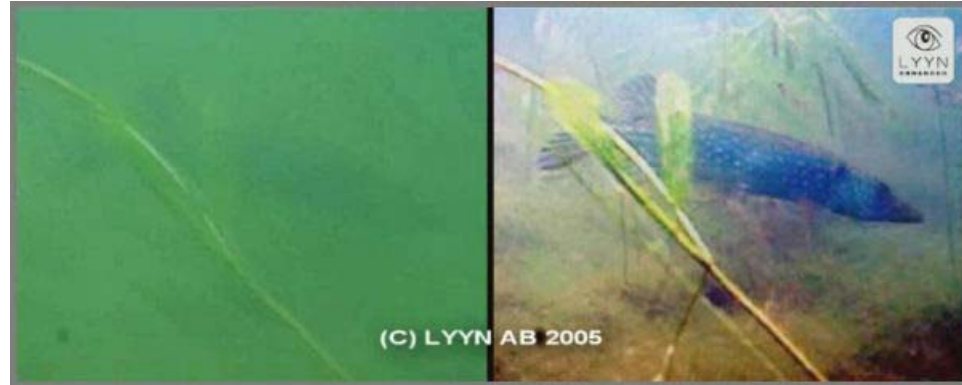
A clear view under water

In any situation where you need a clear view, you need LYYN T38™.